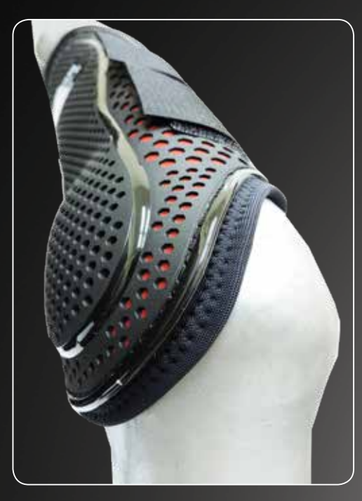
Low Profile and Form Fitting